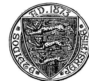
Fig.5 Example evolution of heraldry over time